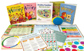
The HENRY Parent Toolkit – free to everyone joining a HENRY programme

The HENRY toolkit will help you give your child a great start in life, get the whole family involved, and keep track of how well you're doing.